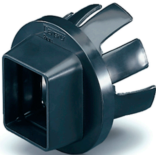
Figure 1 Rinn® universal rectangular collimator (Dentsply Ltd, Addlestone, UK).

exposure. The cost of RC was determined from three different suppliers and was found to be approximately €100. The fact that the use of RC can lead to loss of diagnostic information through cone cutting and that, in a certain percentage of exposures, this leads to retakes has not been incorporated in the calculations in this article.